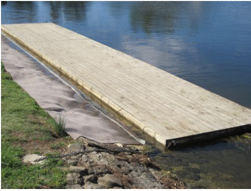
Sample of pontoon for portage exit / entry.